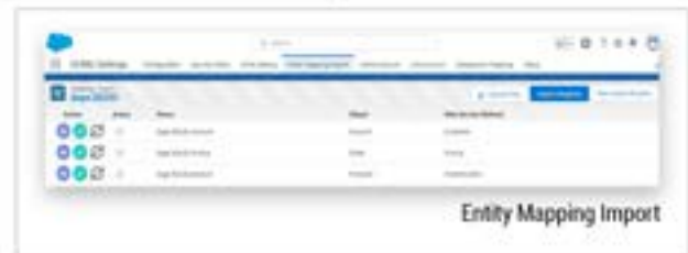
Entity Mapping Import