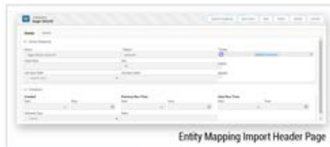
Entity Mapping Import Header Page

Users can now import/export entity mapping in sync routines easily. This feature also allows users to modify data in the file.