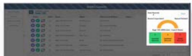
GUMU™ Console Import routine status

Receive timely updates on import routine status as it can be easily viewed on the GUMU™ console