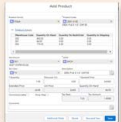
Sales Order Tab

Viewers can now view real-time information of Products while adding/updating line items on GUMU™ Sales Order Screen.