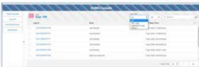
Sales Order Tab

It also alerts users on connection failure/schema changes