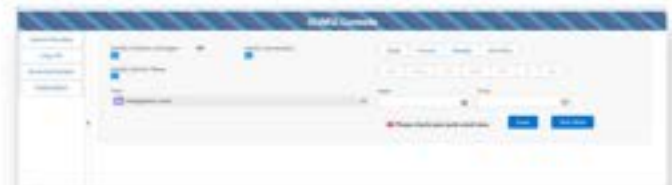
Sales Order Tab