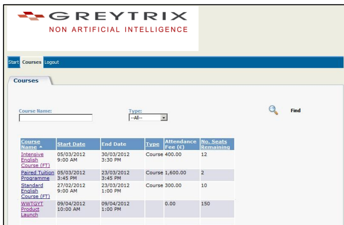
Membership Management Solution Web Portal – Screenshots.

The Web Portal can also allow members to access secure areas of an organisations website, enabling them to download course material, if needed.